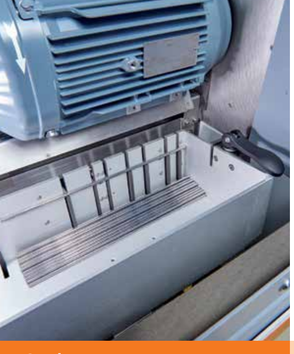
Loading and separation

The HMT-S15 is the standard machine in our product line for separating carbide and HSS. The production area lies between \emptyset 3 mm - \emptyset 40 mm. With a large and easy-to-load magazine, it is ideal for medium to large quantities. The best tried-and-tested P&S separation technology is installed.